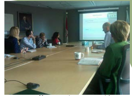
CCA Staff enjoy the Network's webinar from Ottawa